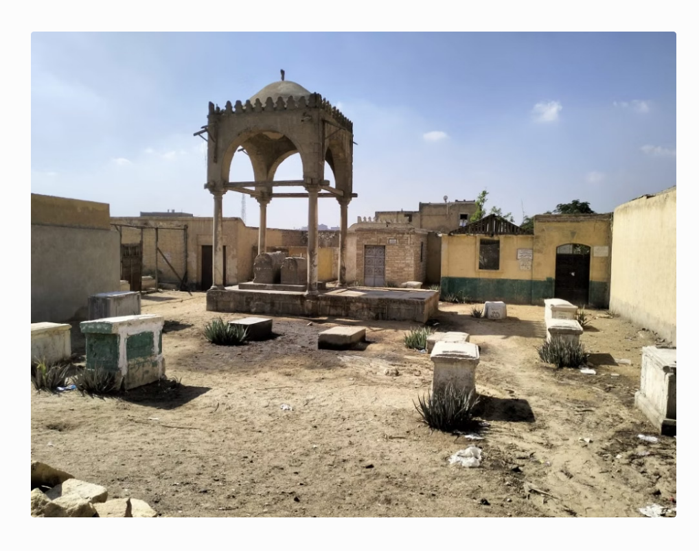
The City of the Death, Cairo